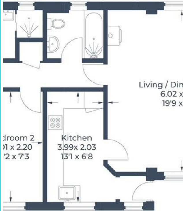
Illustration for identification purposes only, measurements are approximate, not to scale. © CJ Property Marketing Produced for Fine Homes Property

Approximate Gross Internal Area = 76.8 sq m / 827 sq ft